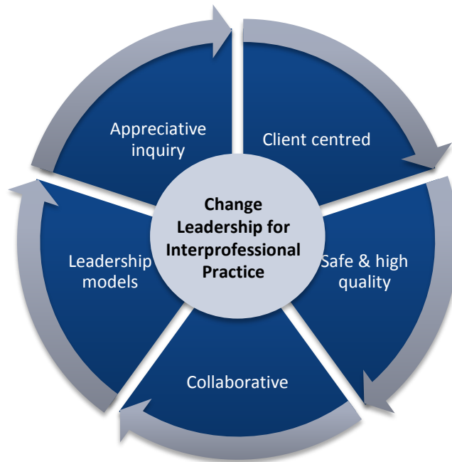
Figure 3: The programme's conceptual framework

Client-centred: The participants are seen as the programme's clients and thus are members of the project team. Hence, they have a key role in the design of the programme. An important component in involving them in the programme design is the participant needs assessment questionnaire. The results of this are used by the facilitator(s) to adapt the programme by emphasising and de-emphasising particular modules. The second key element of the client-centred approach is the collection of local examples of interprofessional education and/or practice in action to ensure relevance. Where these are limited or non-existent, the examples provided in this programme package can be shared with participants to highlight what is possible. The third key element of a client-centred approach is the focus on scenarios throughout the programme to ensure a high level of interactivity and engagement for participants.