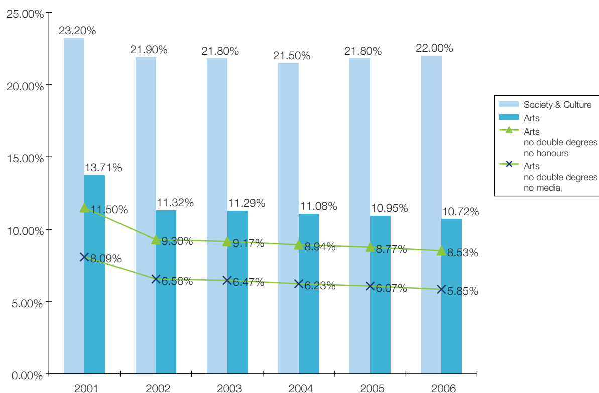
Figure 1: Programs in the field of Arts against programs in the DEST field of study of Society and Culture 2001 – 2006