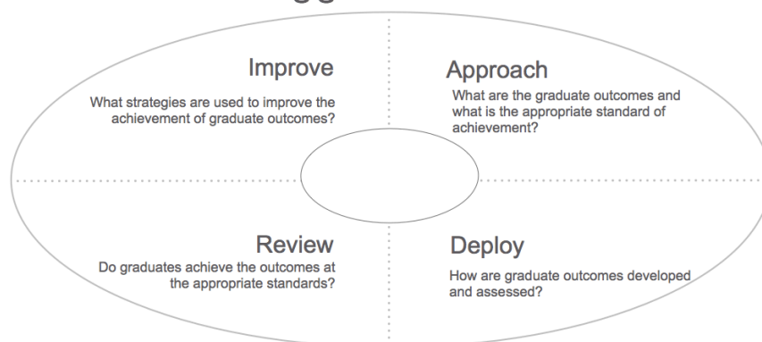
Figure 2 An ADRI approach to assuring graduate outcomes